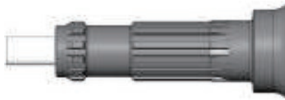
Hammer uses Q40 style shank Bit